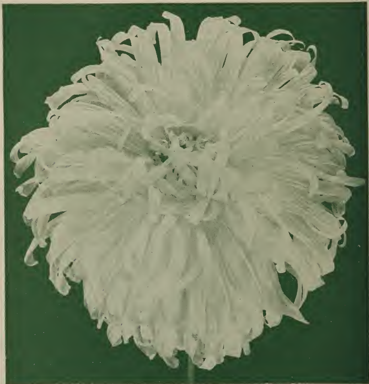
Aster Improved Giants of California White

This beautiful curled and interlaced flower stands at the head of the list of the finer type Asters, not only for florist's use but also for private gardens, where quality is appreciated. Characterized by the well known Crego or Ostrich Feather type of flower, combined with the long non lateral stems and sturdy habit of growth of the Beauty type, this improved strain demands a place in every garden. The large flowers are packed with broad, graceful petals, borne on stems over two feet long, and plants grow from two to three feet in height, starting to flower in early July and continuing until frost. Above is a reproduction of the White, taken from blooms in my trial gardens, the past summer.